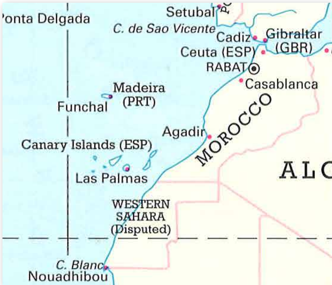
Figure 2 – Map of Spain and Morocco in the Atlantic Ocean: Lloyd's Maritime Atlas of World Ports and Shipping Places (Colchester, LLP Ltd 1999) 10.